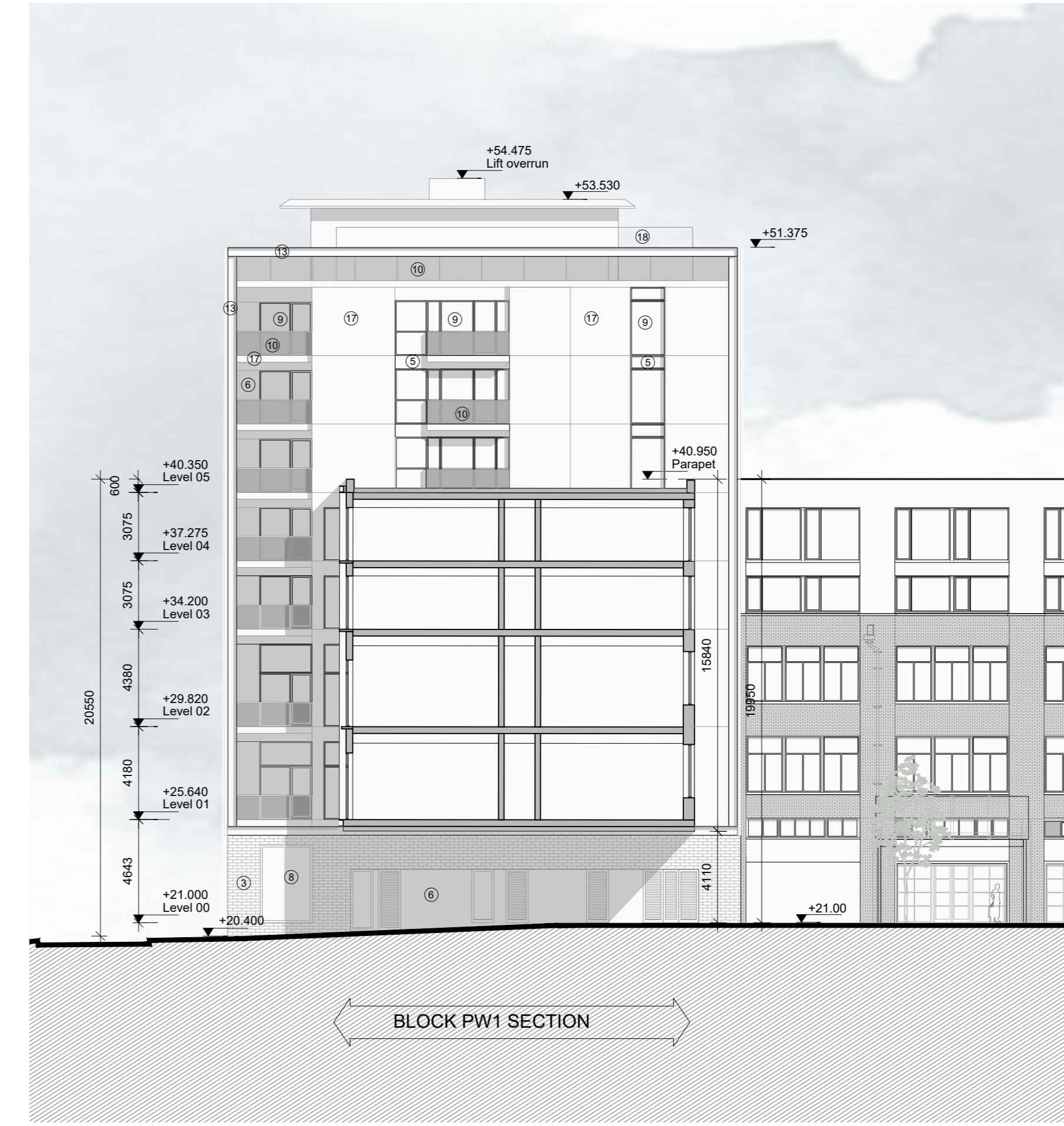
02 Section I Player Wills Site SCALE 1:200